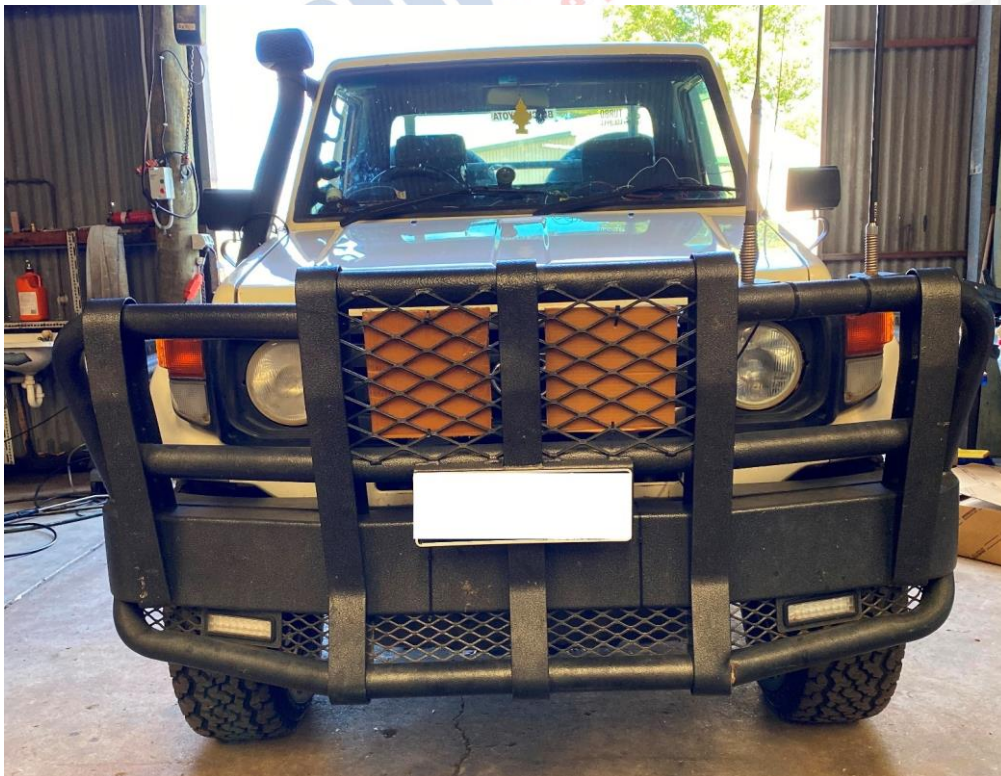
Cardboard cut-outs fitted to simulate spotlights.