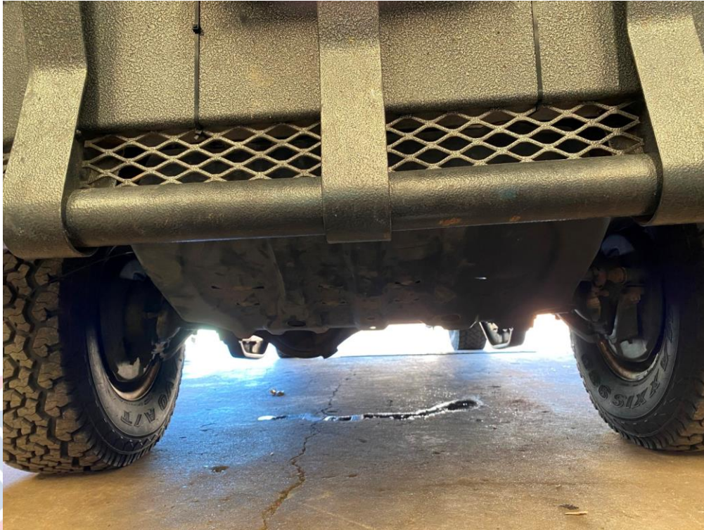
Air dam fitted under front of vehicle to see if would help extract hot air from the engine bay.

temperature drop across radiator of 10°C. At 110 km/h the temperature rose to 90 - 91°C, stabilised at that and 10°C drop across radiator.