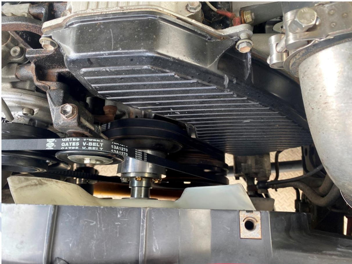
Diesel Performance Parts Hi-Flow Viscous Hub and Fan Kit installed to engine.

across the radiator was 14 – 16°C. At 110 km/h the temperature rose to 83 - 84°C, with across radiator drop of 12 - 14°C. Temperature recovery when slowing was noticeably quicker.